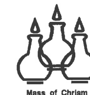
Mass of Chrism

Next ShareLife Sunday is May 7, 2017 Please give generously.