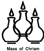
Mass of Chrism

Mass of Chrism is a special Mass, held in Toronto at St. Michael's Cathedral for the priests of the Archdiocese of Toronto, on the Tuesday of Holy Week, April 16, at 11:00 a.m. At the Chrism Mass the holy oils used in the Sacraments of Baptism, Confirmation, Holy Orders and Sacrament of the Sick are blessed and supplied to the local parishes for use. All are welcome to attend.